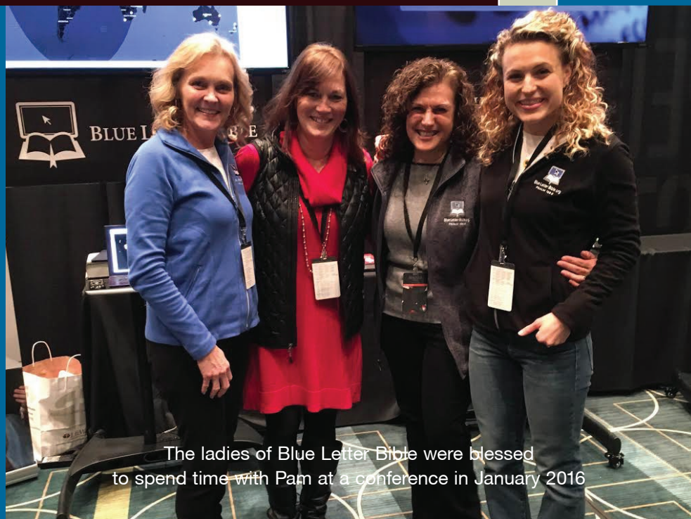
The ladies of Blue Letter Bible were blessed to spend time with Pam at a conference in January 2016

We are truly humbled at the way God is using the Blue Letter Bible ministry to help make disciples. QR