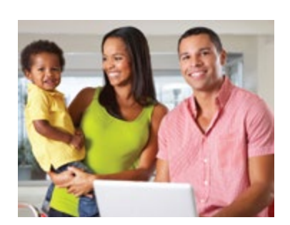
Our Blue Letter Bible users find balanced, traditional, Orthodox Christian resources such as these in our content section:

Catechisms are reference manuals of doctrine, written in a question-and-answer format with many supporting verse references. Confessions are written in essay style and organized according to subject, complete with verse proofs to reinforce your study of God's Word. We are able to provide resources like these thanks to the faithful gifts of donors just like you.