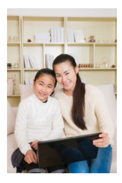
Our free website has a whole new look and it's easier to use than ever!

For over a decade we have continued to add new study resources and features without changing the overall layout of our site. Now our new version offers easier accessibility to all of the features that you use the most.