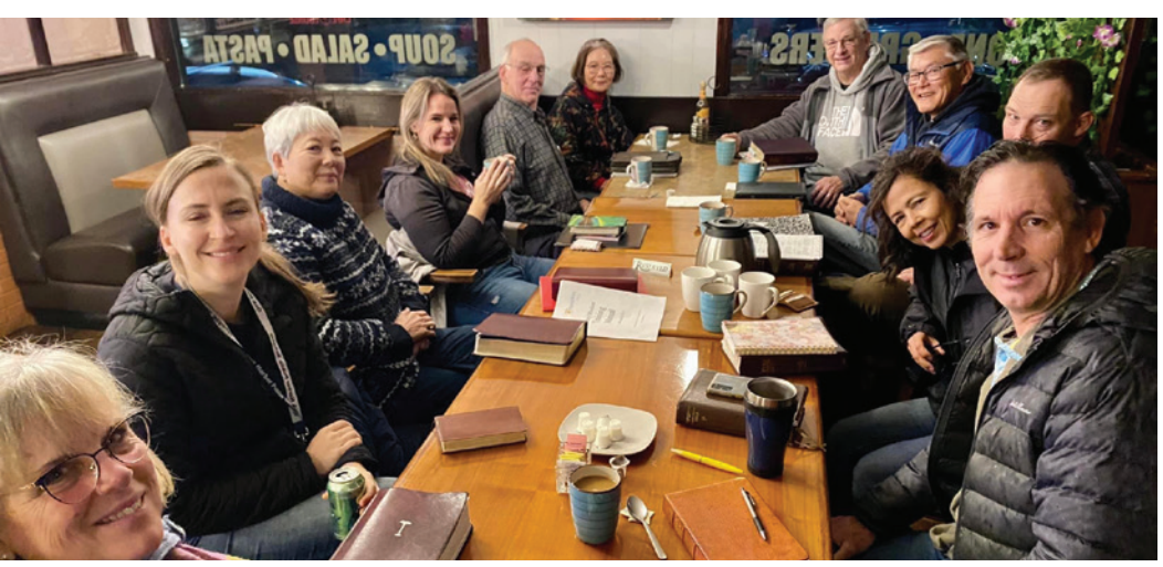
The Whidbey Island Navigators team

Our military is a treasured part of our country. They leave their homes for various amounts of time, placing themselves in constant danger. They risk their physical and mental well-being for a country of people who they do not even know. In a similar manner. Christians continue to minister to a world of people that they do not know, putting themselves amidst an intense spiritual war that they cannot see with their physical eyes. Both groups need people to minister to them. And that is where