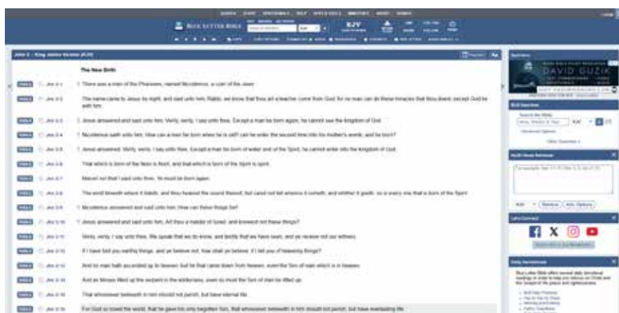
The current version of the BLB website

Study the written Word to know the living Word, Jesus Christ.